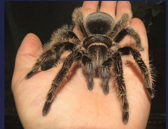
Honduras Tarantula. Roadshow . 2017