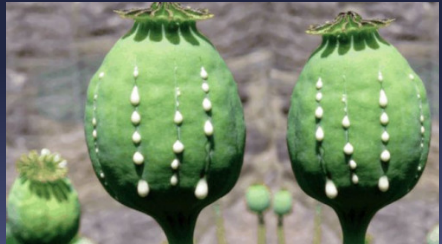
Papaver somniferum. PressTV. n.d.