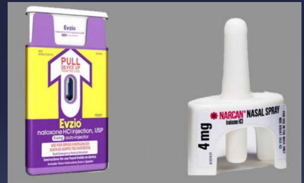
Narcan and Evzio. UFA . 2017