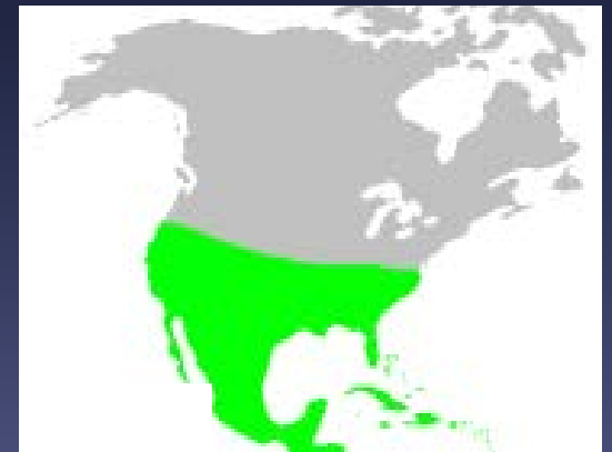
Tarantula Distribution. Pet Tarantulas . n.d.