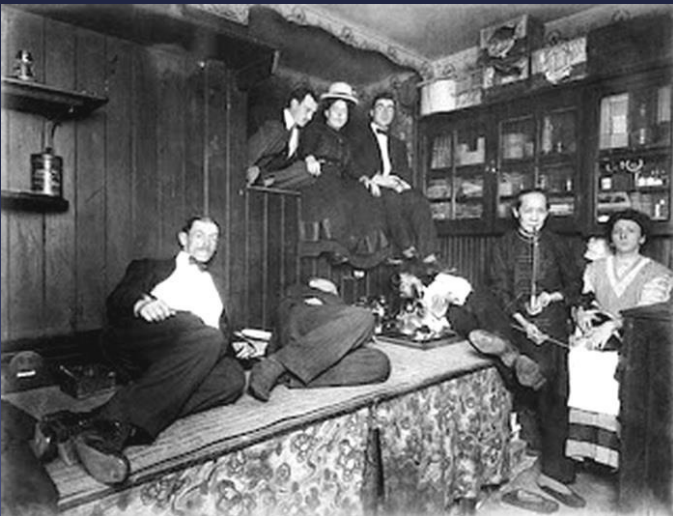
Opium Den. n.d.