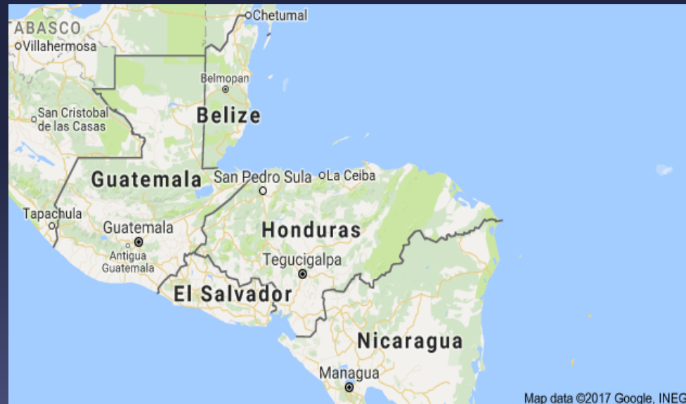
Honduras. 2017